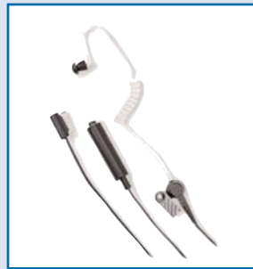
3-WIRE KIT, BLACK

These modular earphone kits prevent receive audio from being overheard by others. Optional noise attenuating kits provide hearing protection while maintaining high-quality audio. The 3-wire kits include a lightweight earphone, rubber eartip, radio connector, and clothing clip. The kit is available in black or beige. The 3-wire lapel mic kit offers a separate PTT and microphone. These kits are ideal for use by security, hotel, restaurant, casino, convention, and light industrial personnel.