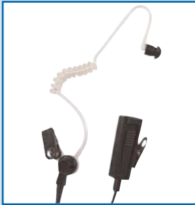
2-WIRE KIT, BLACK