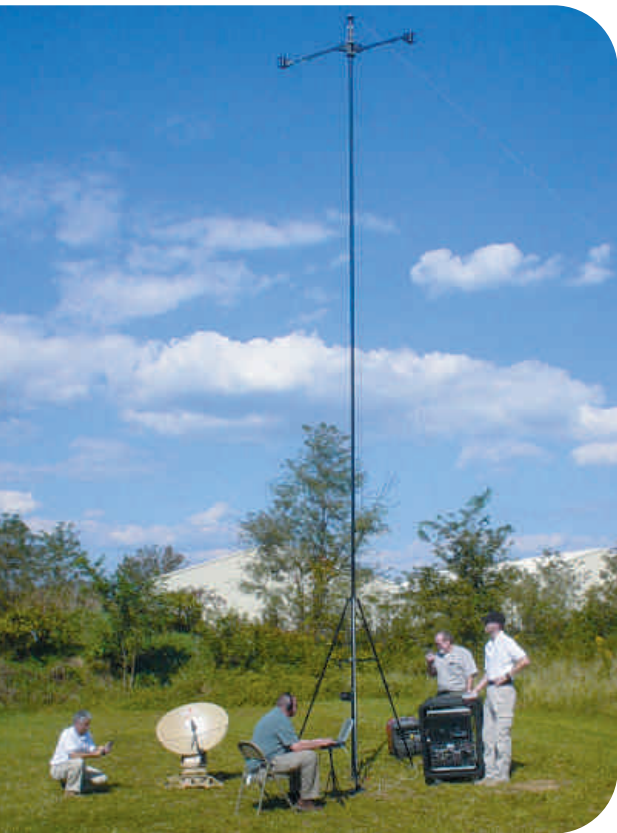
An omni-directional portable mast provides LMR coverage while a self-aligning reflector provides the satellite link. Ruggedized containers protect electronics from shock and vibration during transit ( below ).